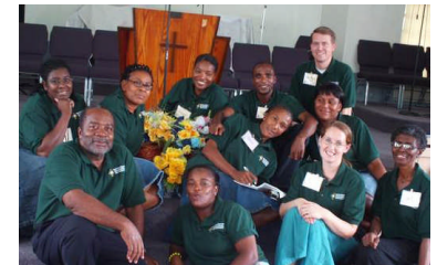
Our Master Teacher colleagues