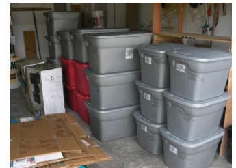
21 boxes, 1556 lbs – goes to PNG! ☺