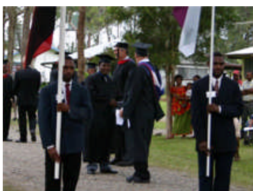
Graduation Parade in Mt. Hagen